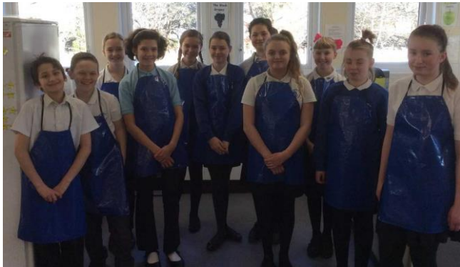
Year 7 Young Chef Finalists