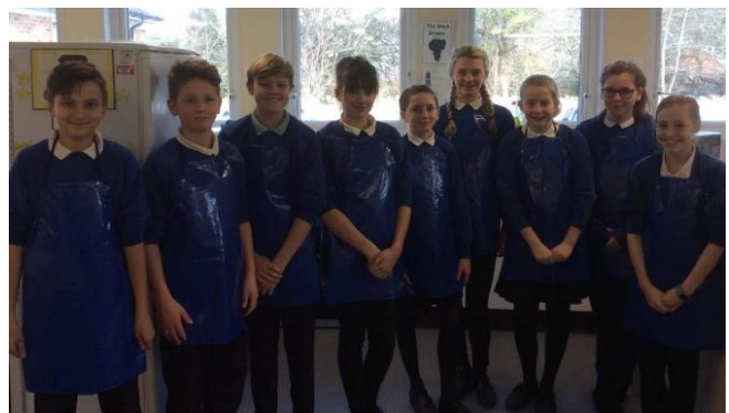
Year 8 Young Chef Finalists