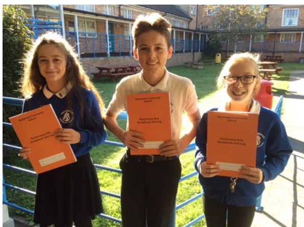
Performing Art Scrapbooks

In 2015/2016 we raised almost £3000.00 for the school to buy resources for the children—these are some of the examples of how we helped;