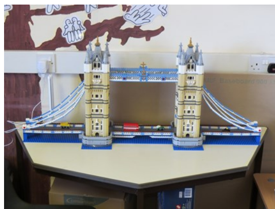
Lego Projects for the HUB—£459.00