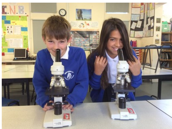
Microscopes for Science—£314.00