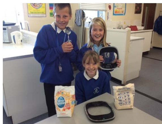
Digital Scales for Food Technology—£119.00