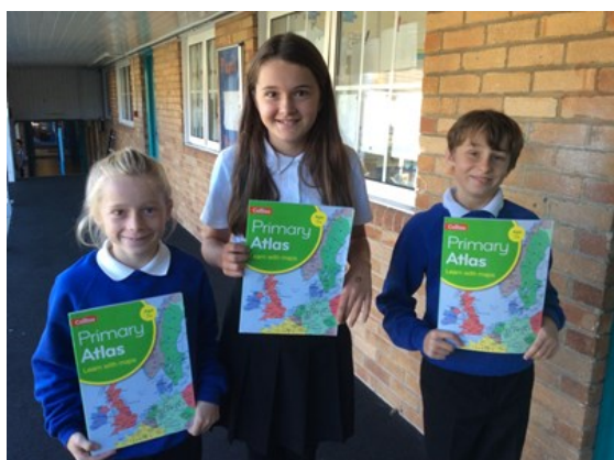
Junior Atlases for Geography